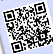
The moon landing explained by Primary 4.

Primary have thoroughly enjoyed learning about the Space Race. They all worked really hard to produce a film explaining the journey that Apollo 11 went on before landing on the moon in 1969. You can see the film by scanning the QR code. You can imagine the excitement of the pupils when they realised that their hard work had been seen by British astronaut, Tim Peake. He even tweeted the school!